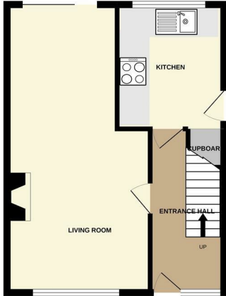
1ST FLOOR 427 sq.ft. (39.7 sq.m.) approx.